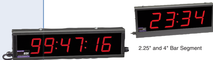
2.25" and 4" Bar Segment