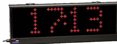
6" / 8" and 12" Dot Matrix

A four digit up-timer, that times by MM:SS or HH:MM. Other formats are available (see next page). A terminal strip is provided to wire two customer-supplied, contact closure inputs for counting and resetting to "00:00". Either a "wet" or "dry" contact can be used. EDI supplies an on-board power supply (14VDC) to hardwire a photo-eye, foot switch, push-button switch, etc. The timer starts at "00:00" and increments by the specified time using an on/off switch. A momentary switch will reset the unit to "00:00". Up to 12 digits available.