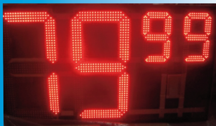
RATE BOARDS (RB)

Displays rates in large LED numbers. Great for Hotels + Restaurant