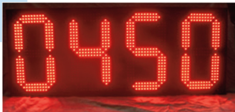
COUNTER UNIT (CR)

Available in Panel Mount or NEMA4 Rated Enclosure