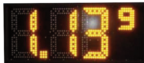
GAS CHANGERS (GR)

Display switches between time and temperature. Down timing display