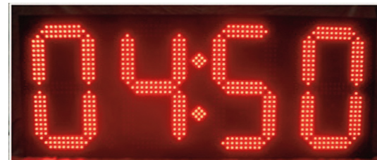
TIMER (TR) - 4-digit up and/or down timing display

4 Digit up or downcount displays count from 1-9999.